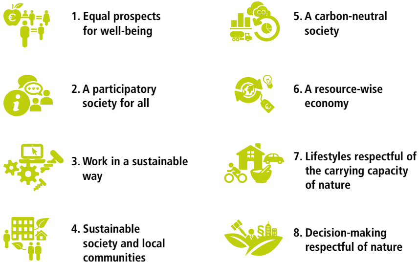
Figure2: The eight objectives of Society's Commitment to Sustainable Development

Society's Commitment to Sustainable Development can be implemented by signing an operational commitment or commitments to act in pursuit of common objectives. Such commitments can be based on one or several objectives of Society's Commitment to Sustainable Development. They must be concrete, measurable and involve something new for the party making the commitment, which must report on the realisation of objectives and measures at regular intervals.