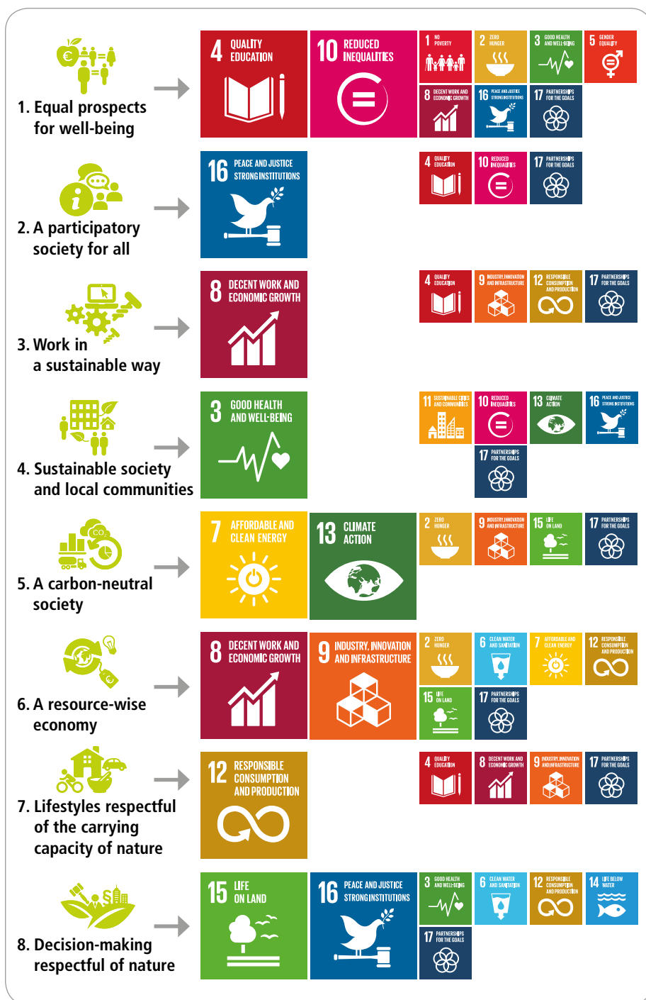
Figure3: Correlation of Finland's national sustainable development objectives with Sustainable Development Goals (SDGs) of Agenda 2030