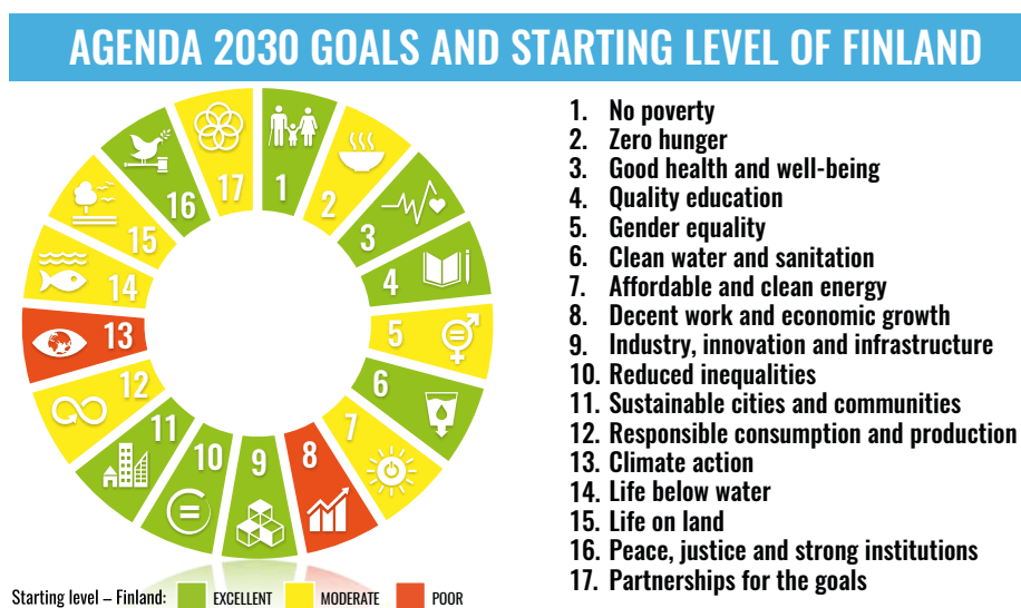
Figure 5. Overall assessment of Finland's status in the implementation of Agenda 2030 Goals and targets, based on indicators selected for the preliminary sustainable development index (Source: Sachs et al. 2016).