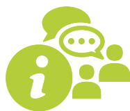
A PARTICIPATORY SOCIETY FOR ALL