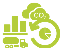
A CARBON-NEUTRAL SOCIETY