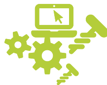
WORK IN A SUSTAINABLE WAY