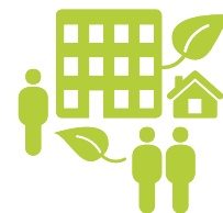
SUSTAINABLE LOCAL COMMUNITIES