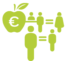
EQUAL PROSPECTS FOR WELL-BEING

In order to reach these objectives, operational commitments are established.