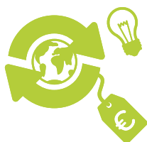
A RESOURCE-WISE ECONOMY