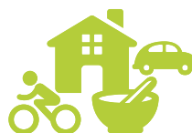
LIFESTYLES THAT RESPECT THE CARRYING CAPACITY OF NATURE