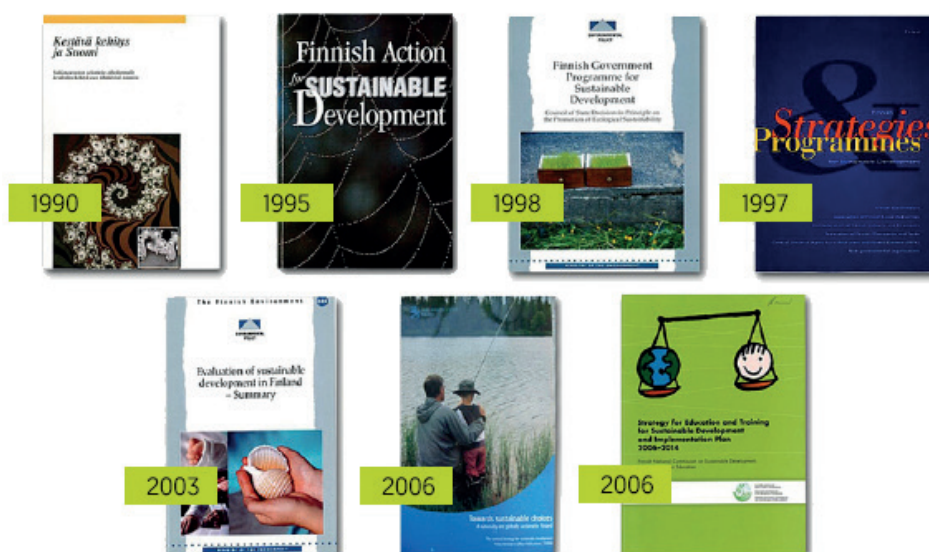
► Finland has a long tradition of sustainable development policies: 1990 - 2006

The guiding principles for national policies and measures on sustainable development in Finland have been high-level political leadership, cross-ministerial guidance, policy coherence, long-term perspective, bottom-up planning, multi-stakeholder participation and continuous dialogue based on mutual learning and trust. In addition, a robust and timely follow-up and review mechanism, including the development and use of sustainable development indicators, has been an integral part of the Finnish model.